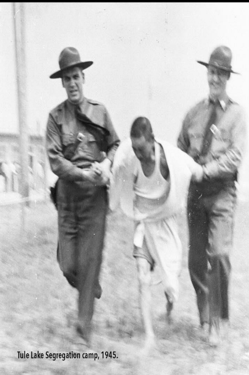
Tule Lake Segregation camp, 1945.