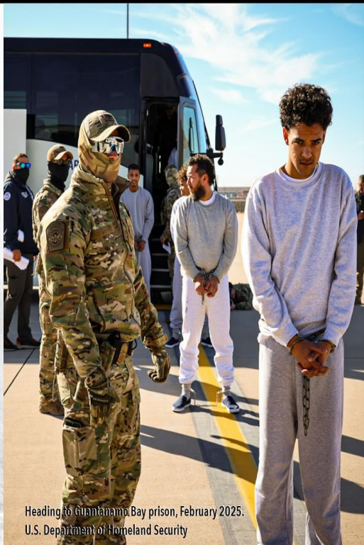
Heading to Guantanamo Bay prison, February 2025.

Tufts student grabbed off the street by ICE says hijab was removed and asthma not treated at Louisiana facility