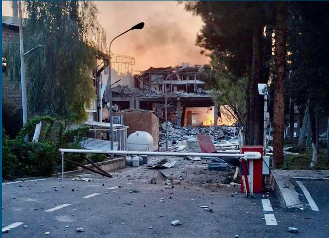
The Pasteur Institute of Iran, one of the nation's leading medical facilities, was bombed on April 2, 2026.

After bragging about throwing out rules of engagement, tens of thousands of bombs dropped on Iran destroy: