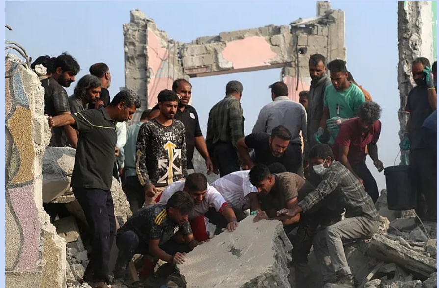
Rescue workers search for survivors in Minab